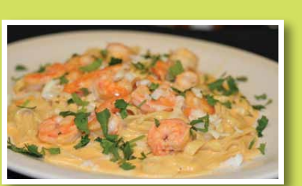
*SHRIMP CHIPOTLE PASTA