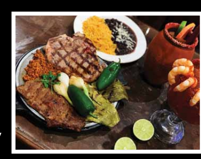
Plate for 2, T-Bone Steak Ribeve Steak, Homemade Chorizo, Cambray Onions Cactus, Rice & Beans

*Chile Rojo o Verde...$18.99 Served with rice & beans