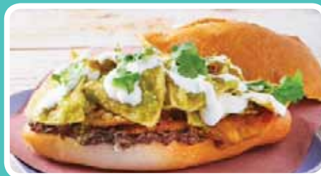
Torta de Chilaquiles