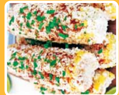
Mexican Street Corn