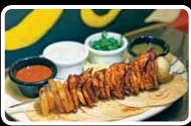
TROMPITO AL PASTOR

Papa Loca ..... 15 Big baked potato topped with your choice of protein: Al Pastor, Steak, Campechana, Grilled Chicken or Chorizo, butter, cheese & sour cream