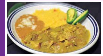
Chile Verde Carnitas