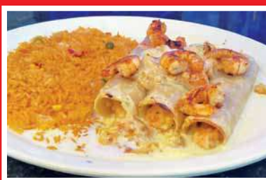
Shrimp Potato Enchilada

Lunch (2) $11.99 - Dinner (3) $15.99 Corn tortillas filled with mashed potatoes, topped with grilled shrimp, green peppers, red peppers & onions. Covered with chipotle sauce & served with rice