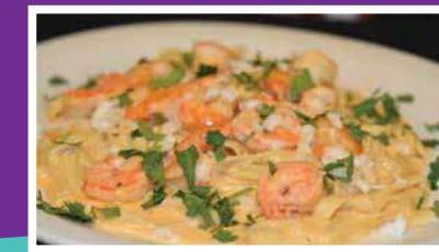
Shrimp Chipotle Pasta