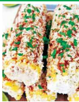
Mexican Street Corn